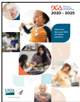
Dietary Guidelines for Americans 2020 - 2025

These significant new publications prompted updates in information and references.