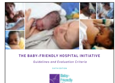
Baby-Friendly Guidelines 6th edition, 2021