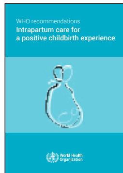
Recommendations Intrapartum Care WHO - 2020